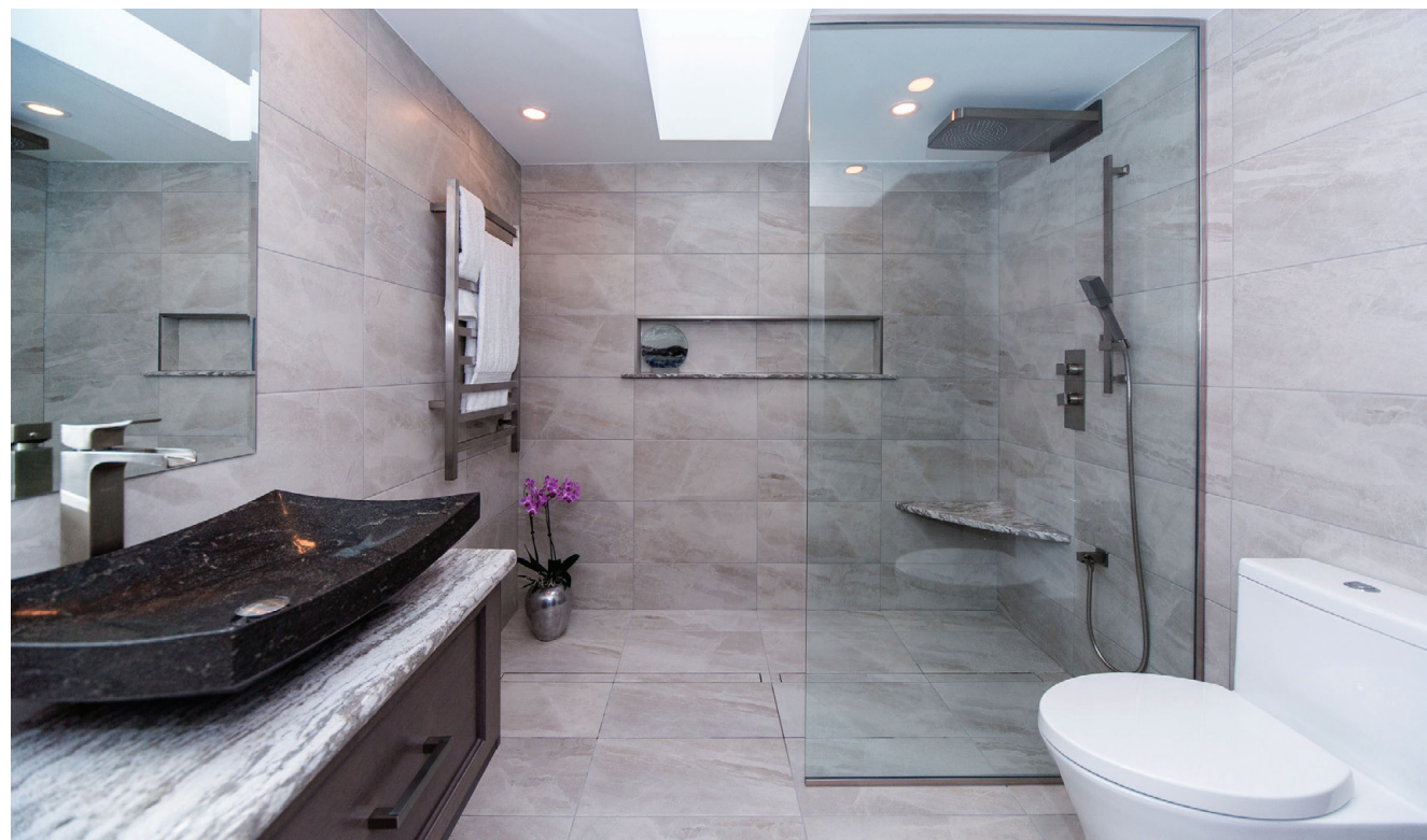
Where once this bathroom was dominated by the large Jacuzzi (below), the new fully accessible shower creates a wonderful sense of spaciousness. The distinctive solid limestone sink atop the floating vanity was a key design element from the outset.

"The most important feature of their new bathroom space is the large, thresh-